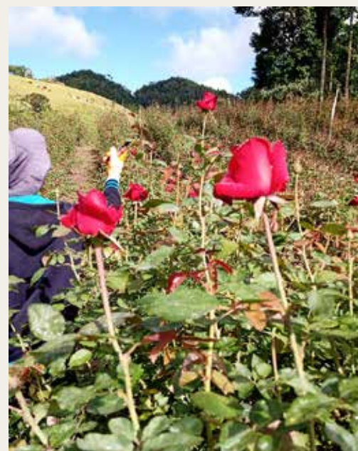
Rose gardens in northwest Rio de Janeiro

The roses used to manufacture Florlik Rose are cultivated in the mountains in the northwest region of Rio de Janeiro, where mild temperatures and rich soil allow the production of superior-quality roses. In this region, the descendants of Swiss and German emigrants, who settled there at the end of the 19th century, have been planting their rose gardens for decades. The product has 100% traceability from the gardens to manufacture: Assessa monitors the process of growing and handling the flowers to guarantee their origin and quality.